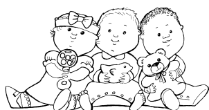
Births in the Church Family