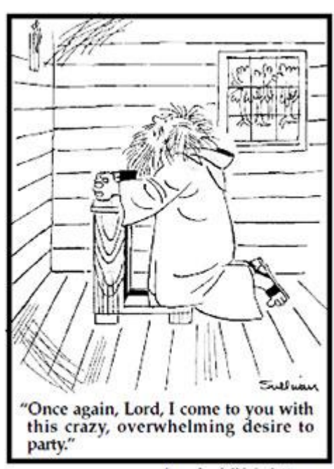
from JoyfulNoiseletter.com